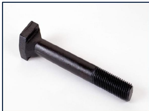
T Bolt / Capsule Bolt