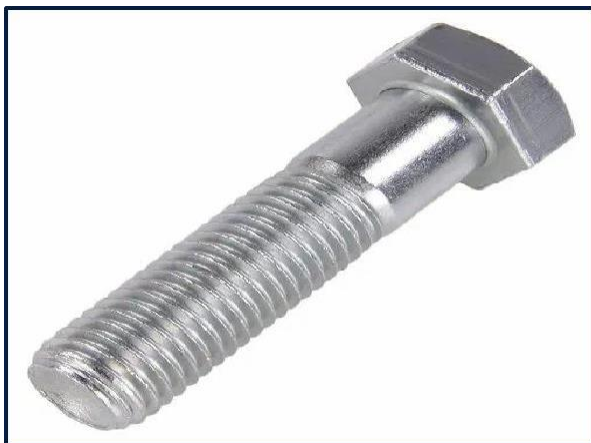
Dummy Bar Bolt

Dummy bar bolts are essential in continuous casting machines (CCM) of steel plants, while T-bolts and square head bolts are commonly used in rail, crane, and heavy machinery assemblies. All items can be supplied with surface finishes such as black/red oxide, hot-dip galvanizing (HDG), or zinc plating as required.