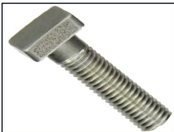
Square Head Bolt